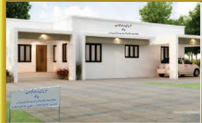
[Proposed picture of Azizi publication]

The aim of it is publishing the poster regarding Holly Ramzan, Eid-ul-Fitr, Eid-e-Qurban, Day of Aashurah, Rabi-un-Noor, Rabi-ul-Ghaus, The Night of Quadr and Barat showing the importance in Islam, and to distribute in nearby areas, and to publish educational, religious and profitable books and pamphlets and also the annual calendar.