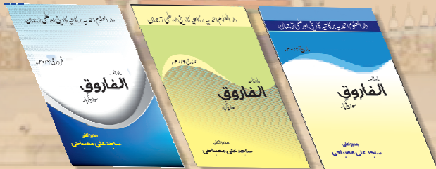
[Proposed picture of monthly Al-Farooque Office]

These people who want to get Islamic knowledge and teachings may quived their thirst. And this monthly also provide the halian with our activities. The monthly Al-Farooque will be published, for them, to increase religious skills, developing knowledge and providing information of our activities.